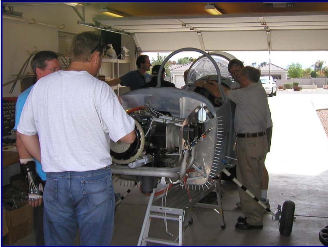
Checking out the project