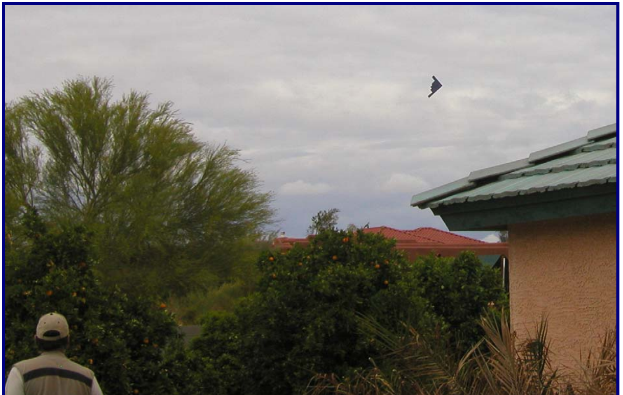
Checking out the airshow