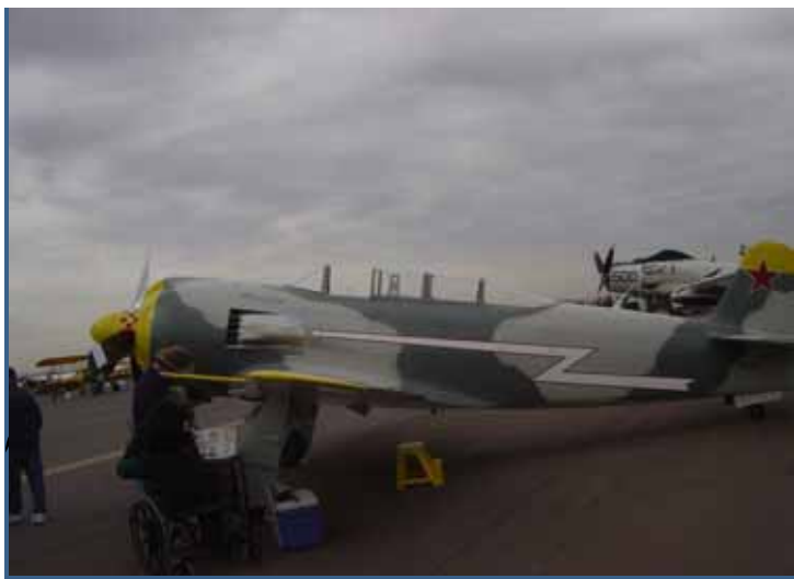
Cactus fly-in 2008