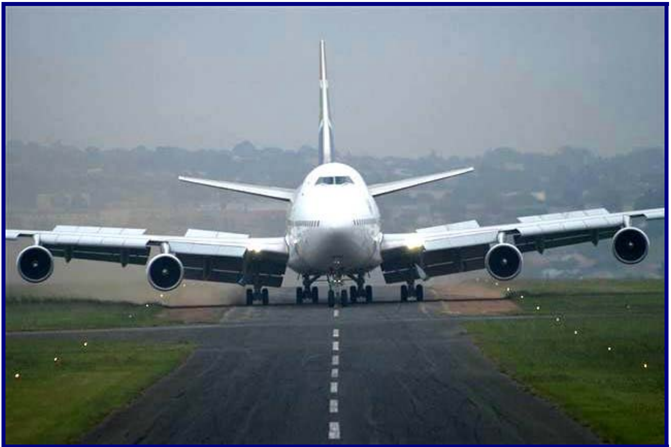
Photo of a B-747 retiring to Rand Airport, South Africa (elevation 5568 feet with 4898 long x 50 feet wide runway!) submitted by Jim Buchanan. See inside for additional photos.